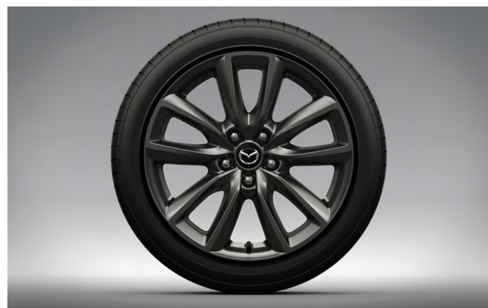
18" Alloy Wheels (Black Metallic)