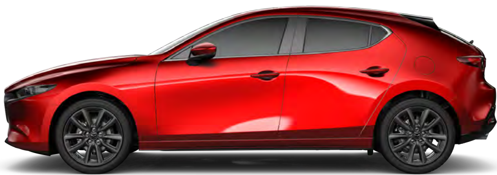
SOUL RED CRYSTAL