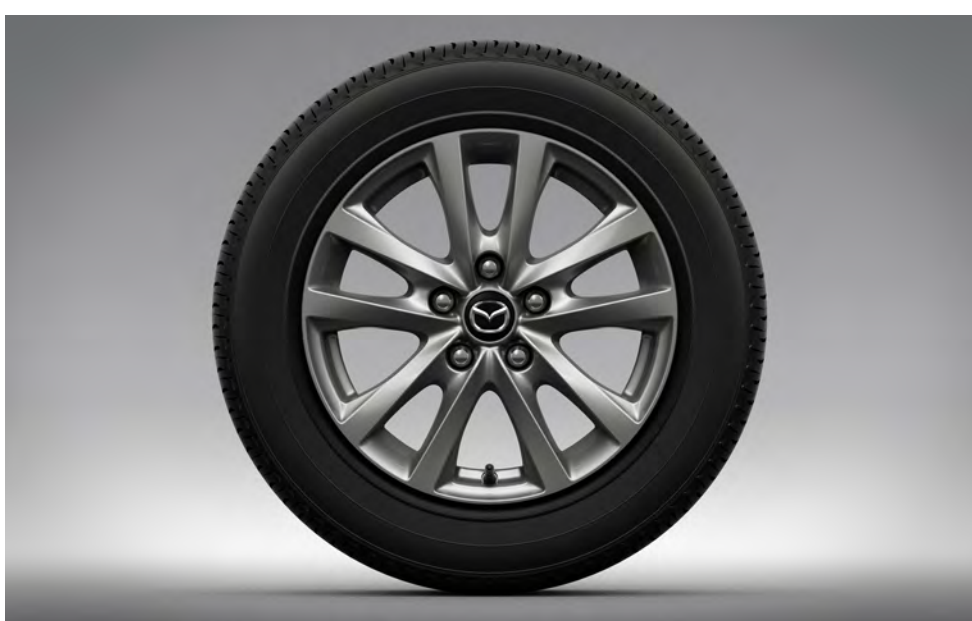
16" Alloy Wheels (Grey Metallic)