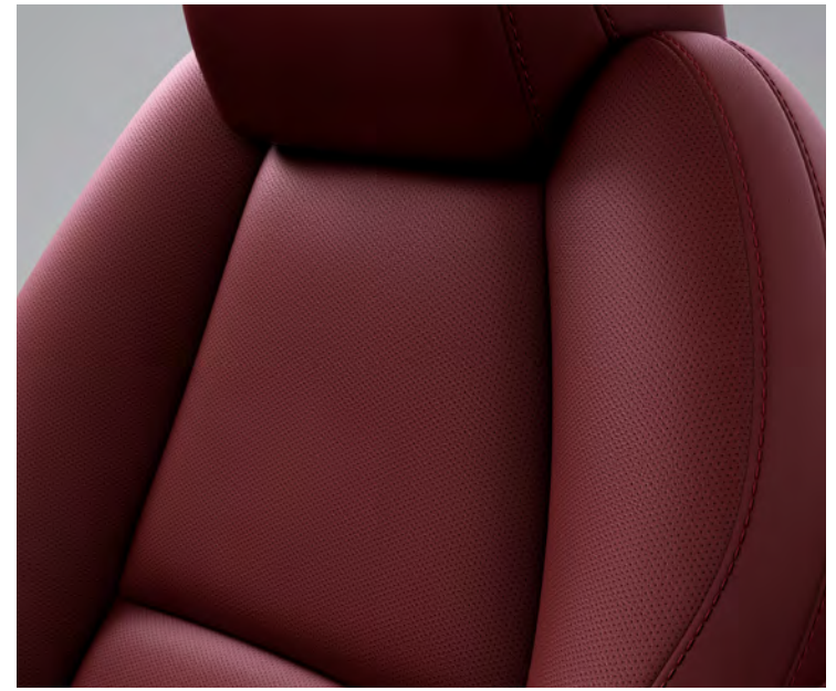
Burgundy Red Leather