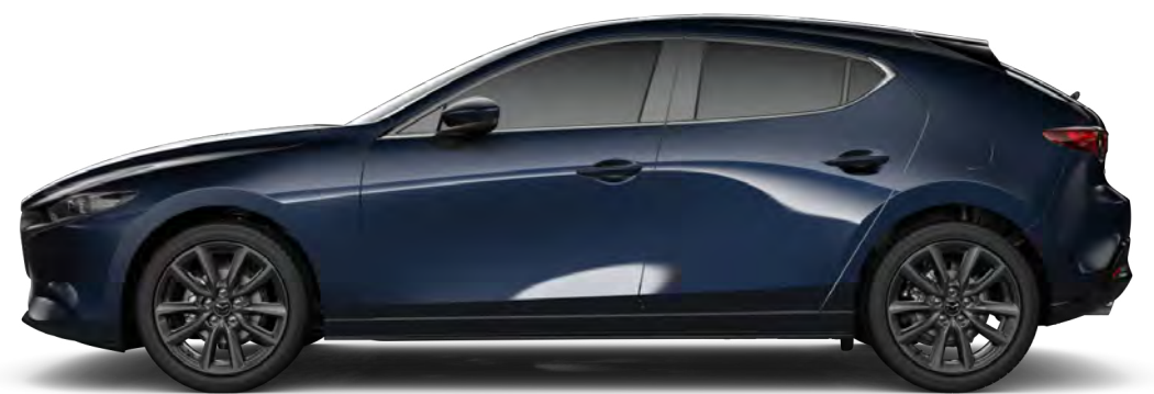
DEEP BLUE CRYSTAL