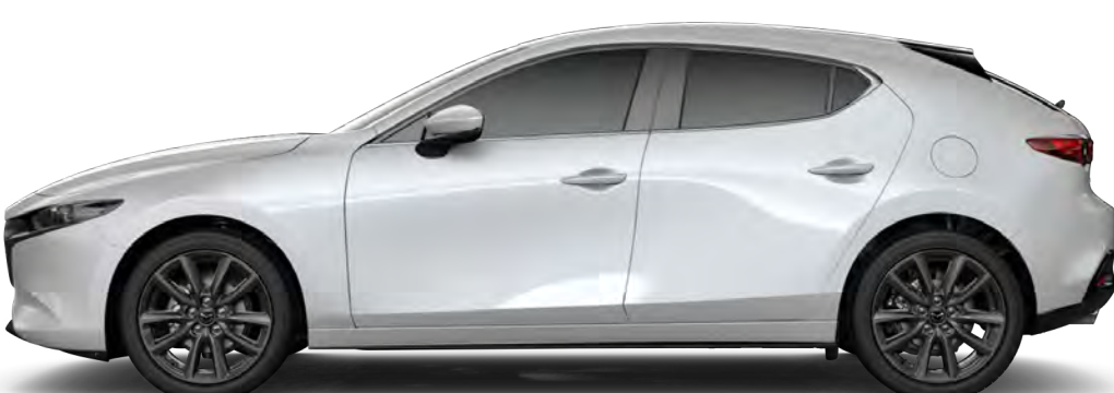
SNOWFLAKE WHITE PEARL