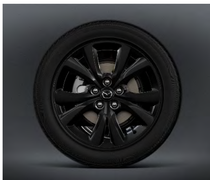
18" Alloy Wheels (Black Metallic)