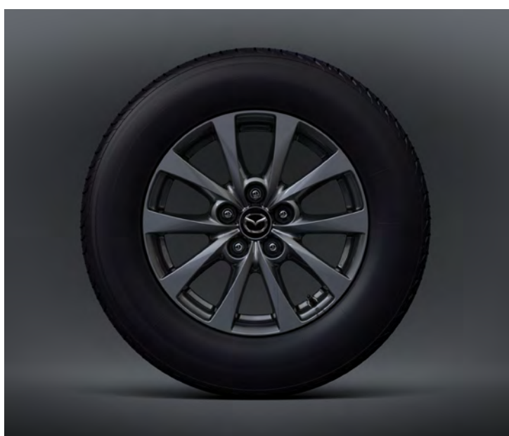
16" Alloy Wheels (Grey Metallic)