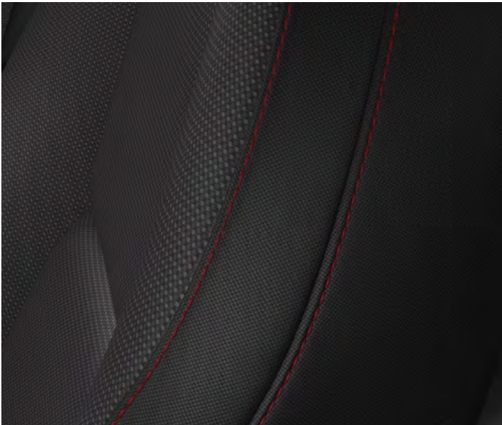
Black Cloth with Red Stitching