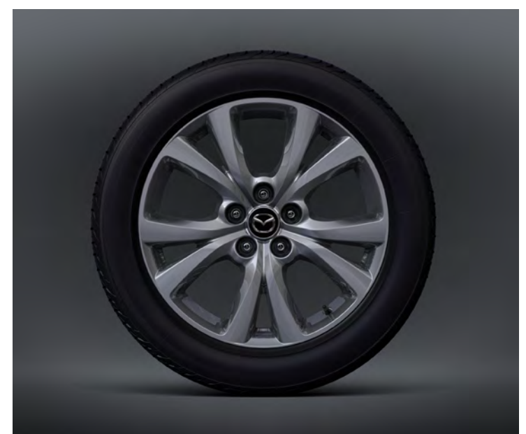
18" Alloy Wheels (Silver Metallic)