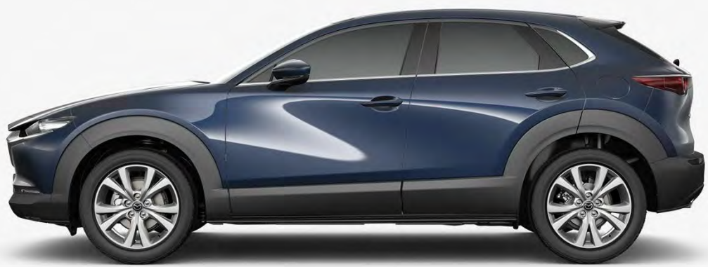
DEEP BLUE CRYSTAL