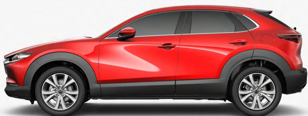
SOUL RED CRYSTAL