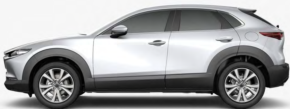
SNOWFLAKE WHITE PEARL